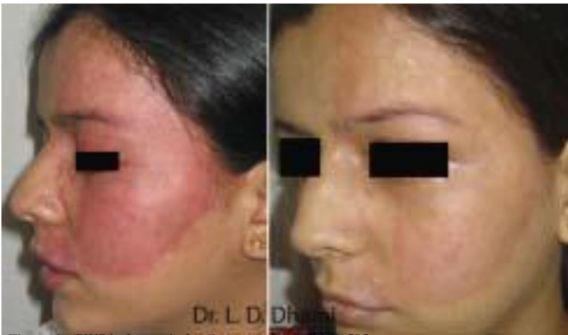
Figure 3: PWS before and after 6 treatments with PDL 595 nm