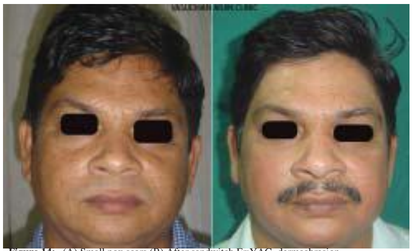
Figure 14: (A) Small pox scars (B) After sandwitch Er:YAG, dermaabrasion, Er:YAG 2940 nm single sitting laser resurfacing

The main advantage of non ablative laser rejuvenation is lack of any downtime for the patients. The devices that target dermal vasculature will help minimise telangiectasias, diffuse erythema or rosacea. Devices which also target melanin like an IPL can also treat lentigines, melasma, poikiloderma, dyschromia and other non specific hyper-pigmentation.