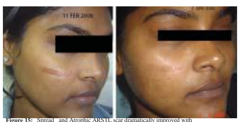
Matisse TM [12] Fractional 1540 nm Erbium: glass laser non-ablative resurfacing

more, including reduction of wrinkles, levelling of deep scars and vaporisation of superficial skin lesions [Figure 14]. Unacceptable down time of this procedure led to the development of a promising non-ablative resurfacing techniques, which is now in the forefront.