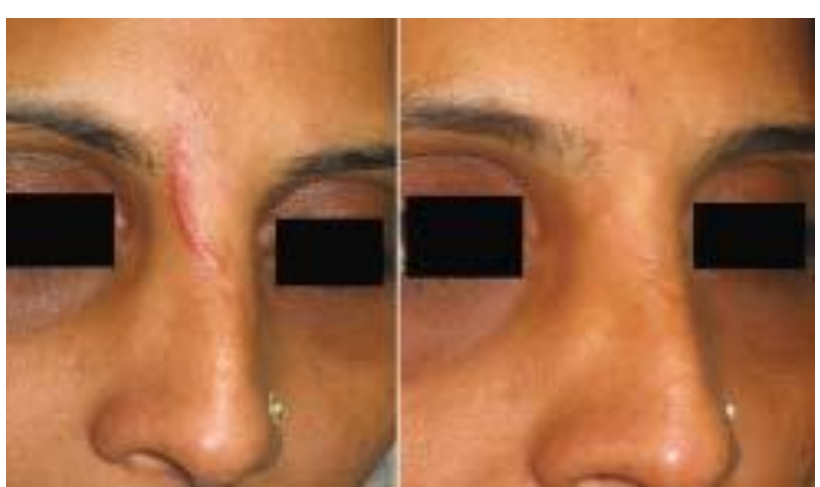
Figure 7: Post traumatic hypertrophic scar before and after 1 PDL and 4 IPL treatments (590 > lter.)