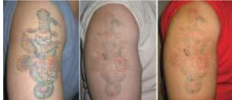
Figure 12: Multicolored tattoo treated with 4 simultaneous treatments with Q-Switched 1064 nm (for black and green) and 532 nm (for red). Small hypertrophic scar is pre-existing

higher fluence for subsequent treatments.