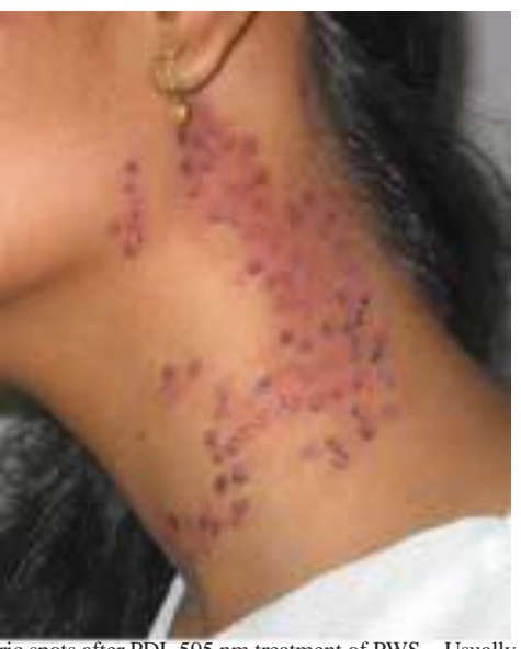
Figure 18: Purpuric spots after PDL 595 nm treatment of PWS. Usually they clear in a 5 to 7 days period

Fractional Laser Resurfacing delivers light in an array of high precision micro beams. These micro beams create narrow, deep columns of tissue coagulation that penetrate well below the epidermis and into the dermis, while sparing the tissue surrounding the columns from damage. The coagulated tissue within the columns