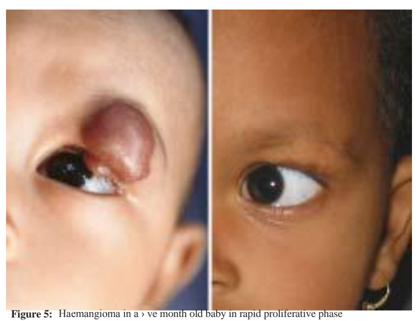
before and 1 year after 5 treatments with Nd:YAG 1064 nm. Note undamaged eyebrow and eyelashes, example of chromophore speci) city. Eye was protected by a special metal corneal shield.

expected to be near total [Figure 11]. In case of tattoos however, no other laser technique is found to be more effective than Q-switching. In a multicolored tattoo for black ink QS 1064 nm, QS 755 nm and QS 694 nm are excellent. For red ink FDQS 532 nm is excellent. For green ink QS 755 nm, QS 694 nm and QS 1064 nm are found to work in that order. [Figure 12]. In India most commonly done tattoos are amateur and religious using carbon which clears very well with 1064 nm. [Figure 13]