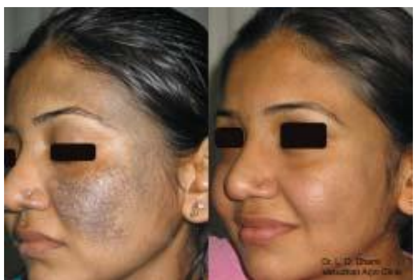
Figure 11: Nevus of Ota before and after Q-Switched Nd:YAG 1064 nm laser treatments. Please note the complete clearance of the pigment without any residual textural skin change.